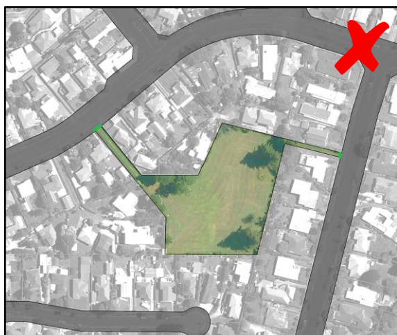
Poor outcome with poor road frontage, zero passive surveillance from public space, and limited narrow entrance points.