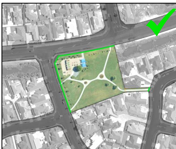
This example demonstrates excellent road frontage, and internal and external connectivity.